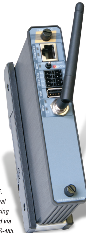
In a compact footprint, TBox TG2 includes Ethernet, RS232, RS485, USB, and a communications option such as 3G. For installations requiring additional I/O, TBox TG2 readily expands using compact modules interfaced via Ethernet or RS-485.