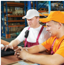
Operations and maintenance Extensive capabilities including Web 2.0 and Plug & Go expedite service and support.